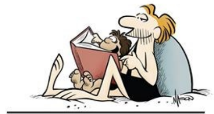
Literacy Legacy Project